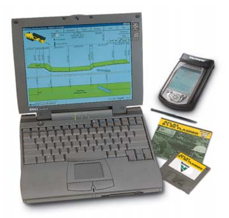
The efficient, economical way to plan a bore. Vermeer ATLAS BORE PLANNER® software heightens professionalism by aiding the operator in preplanning the bore and comparing the planned bore path with the actual bore path. The Vermeer FieldCalc™ system combines software and a hand-held computer to provide job site calculations, including setback distance, pullback time, and point-to-point calculations.