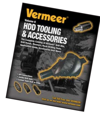
The Vermeer Cutting Edge Group produces some of the world's most popular HDD tooling, specialty tooling, and custom-made tooling. Call for a FREE HDD accessories catalog! Call 1-866-VERMEER or view online at www.vermeer.com.

At any given time, more than half of all horizontal directional drilling units in the world are Vermeer NAVIGATOR machines. To help provide smooth-running operations, Vermeer offers everything you need – from one-day training seminars to computer software – for more efficient bore planning and performance.