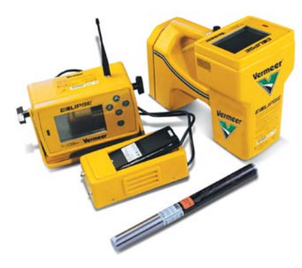
Locating systems are developed by working closely with the world's premier locating companies. Vermeer helps keep you on the leading edge of technology by offering a variety of options designed to meet the needs of varying applications.