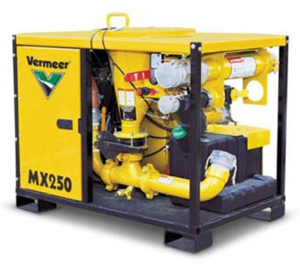
Vermeer drilling fluid manage ment systems provide the horizontal directional drill with quality mud mixing in a minimum amount of time. Smaller systems are self-contained on a mounting skid. Larger systems are available preassembled on mounting platforms to provide drilling operations with greater versatility.