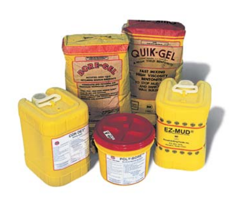
Wetting agents, polymers, and bentonites — you need the right mix to get through the tough bores. Vermeer offers specially formulated nontoxic polymer and bentonite drilling fluids to get the job done.